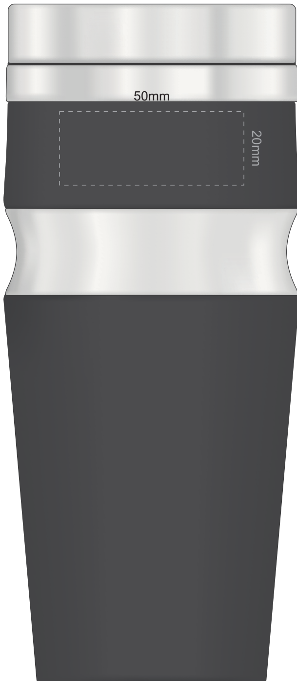
100% of Actual Size Pad Print